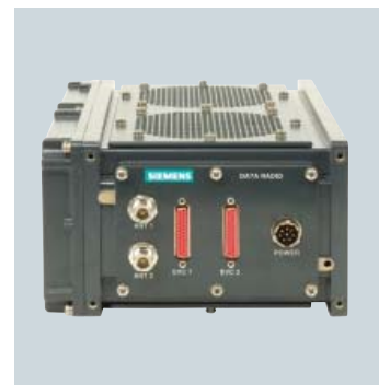
ETCS data radio