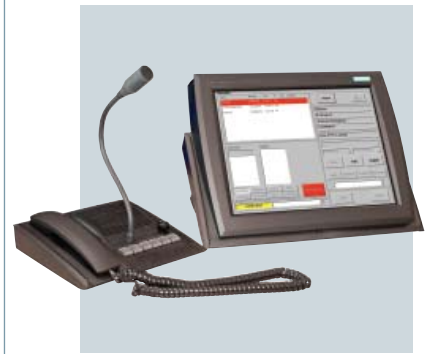
Fixed dispatcher terminal

With its expertise in maintaining trains Siemens is in a strong position to help plan the installation of the on-board train equipment and to minimise expensive down time. Siemens 'train ready' cab radios are specifically designed for fast installation and swap-out: customers can fit an install kit at a convenient time when the train is undergoing routine maintenance, and then add the radio itself when required, saving on warranty and cash flow. The actual radio fitment, or replacing a faulty radio, typically takes only 15 minutes.